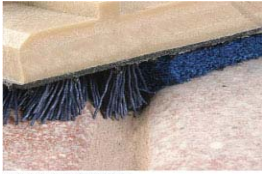
Cutaway view of POWER-PAD™ in use.

The Malish POWER-PAD™ is a unique combination of a brush to handle all the "lows" and a pad driver to clean all the "highs". This design creates a multi-level scrubbing action that produces results superior to standard rotary brushes and pad drivers. Reduces the need for multiple passes during floor stripping or scrubbing. Ideal for use on unsealed or sealed concrete, terrazzo, vinyl tile, ceramic/quarry tile and linoleum.